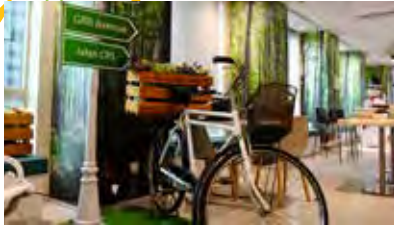
The Enterprise Risk Services team transformed our staff lounge, D. Lounge, into a warm and cosy traditional Western home for their year-end party, with different corners of the lounge separately decorated to represent the different scenes of Christmas.

Our departments held their year-end party celebrations in many different ways. Check out how they ended the year with a bang!