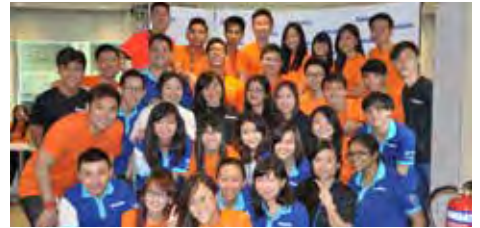
Audit Groups 2 and 3 held their year-end party in conjunction with their December Mentor Challenge on Christmas Eve, followed by a Christmas feast and prize-giving ceremony in appreciation of all the mentor groups for their effort in making the event a great success.