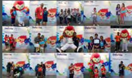
Instagram photos taken at the Deloitte booth at the APG carnival