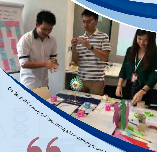
Our Tax staff throwing out ideas during a brainstorming session for Tax Innovation Hour