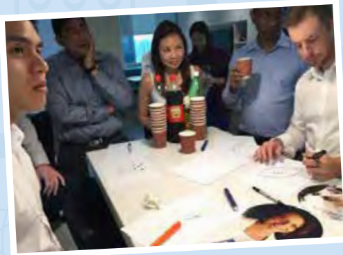
Close to 30 participants from all levels across all functions were present to share their thoughts at the first DxChange session

Innovation Hour introduces staff to the broader world of innovation, bringing prominent trends, innovations and ideas together to pique their curiosities. Recently, our Tax function experienced an out-of-world experience, where their office space was transformed into a space station. Thoughts, ideas and critical views were abuzz, as participants brainstormed ways in which Tax could prepare for, and address the challenges of the future. With more Innovation Hour sessions lined up for the other functions, look forward to meeting our SEA Innovation facilitators and a healthy bout of brainstorming! We want to hear your recommendations, perspectives and opinions on how to stimulate meaningful conversations in order to improve. Ultimately, your thoughts and voice will impact the direction of our firm, and even lead change.