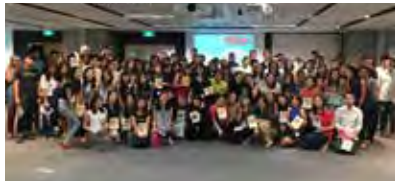
On New Year's Eve, our Deloitte Tax team ended the year with a party filled with various interactive games and lucky draw with attractive prizes!