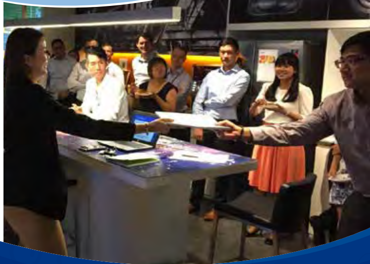
A team races against the clock to complete their concept prototype in a Design Thinking Workshop