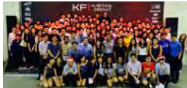
Audit Financial Services Industry Group go-karting Christmas Celebration