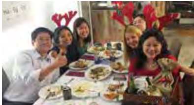
On December 2015, the Clients & Markets team organised a Christmas gathering at Eureka Cooking Lab where they put their culinary skills to the test in a cooking competition.