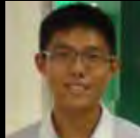
^Kwa Yi Hao yihao.kwa.2013@ accountancy.smu.edu.sg