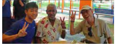
A team of volunteers from Enterprise Risk services spent their time with the elderly at Tung Ling Community Services Centre at Dakota Crescent as part of their celebrations. The ERS team decided to forgo the yearly gift exchange and donate the money to the centre. A total of $2,260 was raised, and 2 foot massagers were donated and 35 goodie bags filled with daily provisions were packed for the elderly.